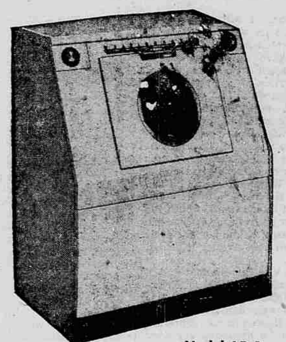
Model AD-1 DRYER SPECIAL Full Size—Automatic Direct Air-Flow Fast Drying