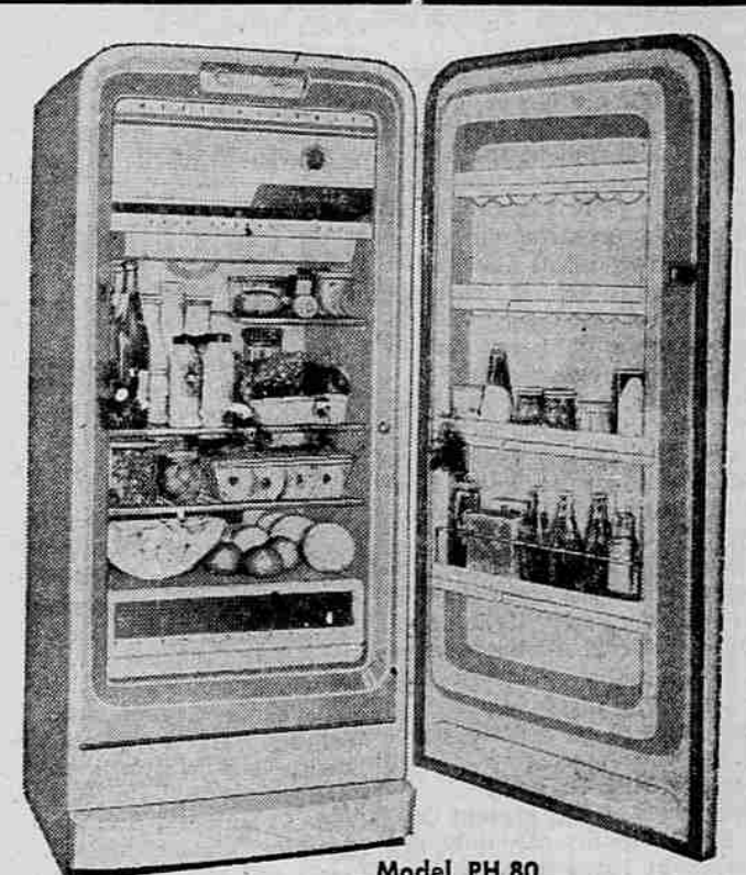
Model PH 80 8 Cu. Ft. REFRIGERATOR PUSH-BUTTON AUTOMATIC DEFROST Regular Price $239.95