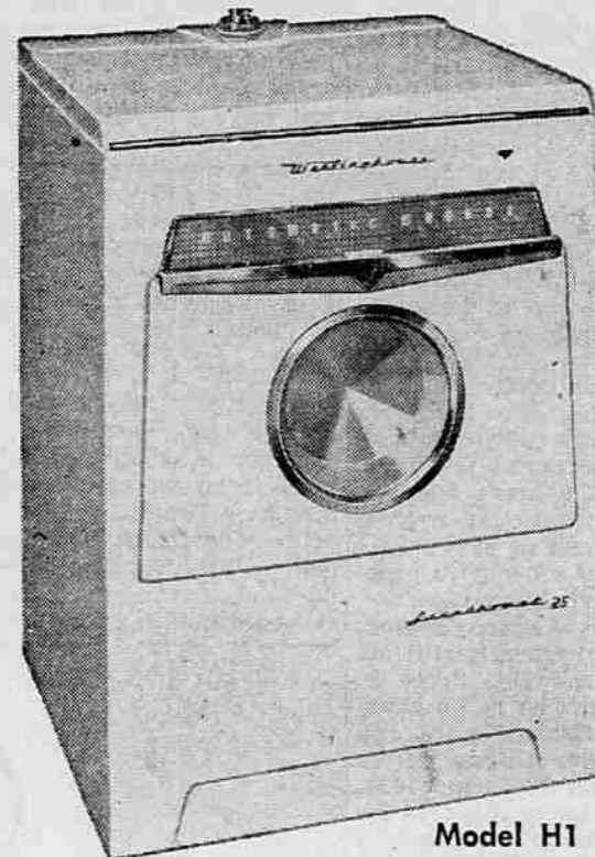
Model H1 25" LAUNDROMAT Fully Automatic—Portable—Under Counter or Free Standing Insulation