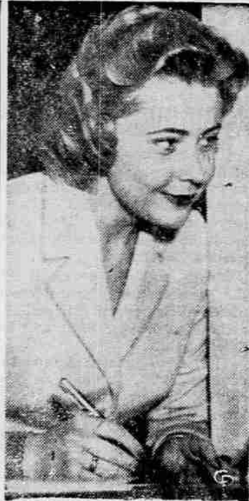
REPORTING at Los Angeles immigration office, Hillevi Rombin, Sweden, Miss Universe of 1956, registers address, other data required of 245,000 aliens.