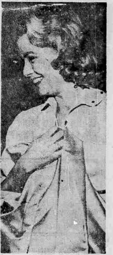
GRACE KELLY Silent on Reports

New York —(U.P.)— Actress Grace Kelly and Prince Ranier