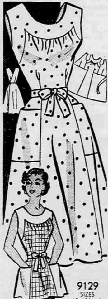
9129 SIZES 10-20; 40

Pattern 9129: Misses' Sizes 10, 12, 14, 16, 18, 20; 40. Size 16 takes 4 1/4 yards 35-inch fabric. This easy-to-use pattern gives perfect fit. Complete, illustrated Sew Chart shows you every step. Send Thirty-Five cents in coins for this pattern add 5 cents mailing. Send to Marian, care of Medford Mail Tribune, Pattern Dept. 232 West 18th St., New York 11, N.Y. Print plainly NAME, ADDRESS with SIZE and STYLE NUMBER.