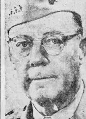
SWORN IN —Lt. Gen. Randolph McCall Pate (above), mild-mannered, battle-hardened Marine, has been sworn in at Washington as the 21st commandant of the Marine Corps. He began his military career as an Army enlisted man.