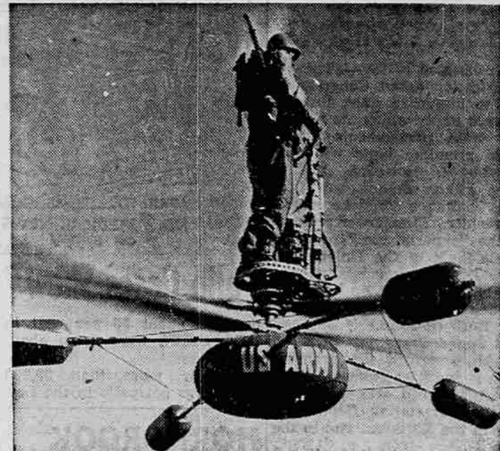
INCREASING MOBILITY of infantrymen, this is new aerocycle being tested at Camp Kilmer, N. J. Pilot stands on platform over rotor blades and guides 200-lb. helicopter by leaning in direction he wishes to travel. Control mechanism is similar to motorcycle; maximum speed, 65 mph.