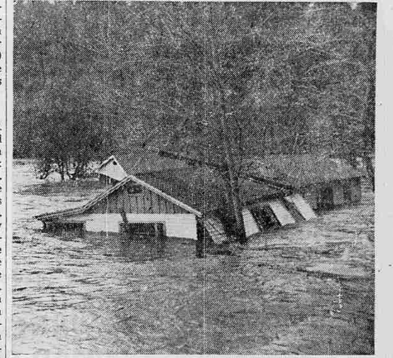
DECEMBER FLOODS CREATE WIDE DESTRUCTION

Record November snowfall blankets the Rogue valley . . . Reconstruction of Hansen building, fire-destroyed home of Medford Furniture company, begins . . . Congressional hearing on timber practices held here . . . Welfare fraud alleged by district attorney . . . Pacific Telephone and Telegraph announces plans to extend toll-free dialing throughout the valley . . . Five cases of burglary cleared by arrests . . . Courteous driver program gets under way . . . School census shows 6,038 people between ages 4 and 19 in district 49 . . . Five year old Central Point boy flown to Eugene hospital with polio.