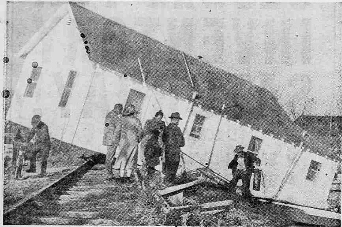
RECEDING FLOOD WATERS EXPOSE DEVASTATION.—Torn from its foundation by the powerful flood waters of the Feather and Yuba rivers, this home in Yuba City, Calif., was deposited on a high railroad embankment two blocks away. The owner found the inside of the home a shambles. The damage throughout the northern California flood area is roughly estimated at $50,000,000 and 33 are known dead.