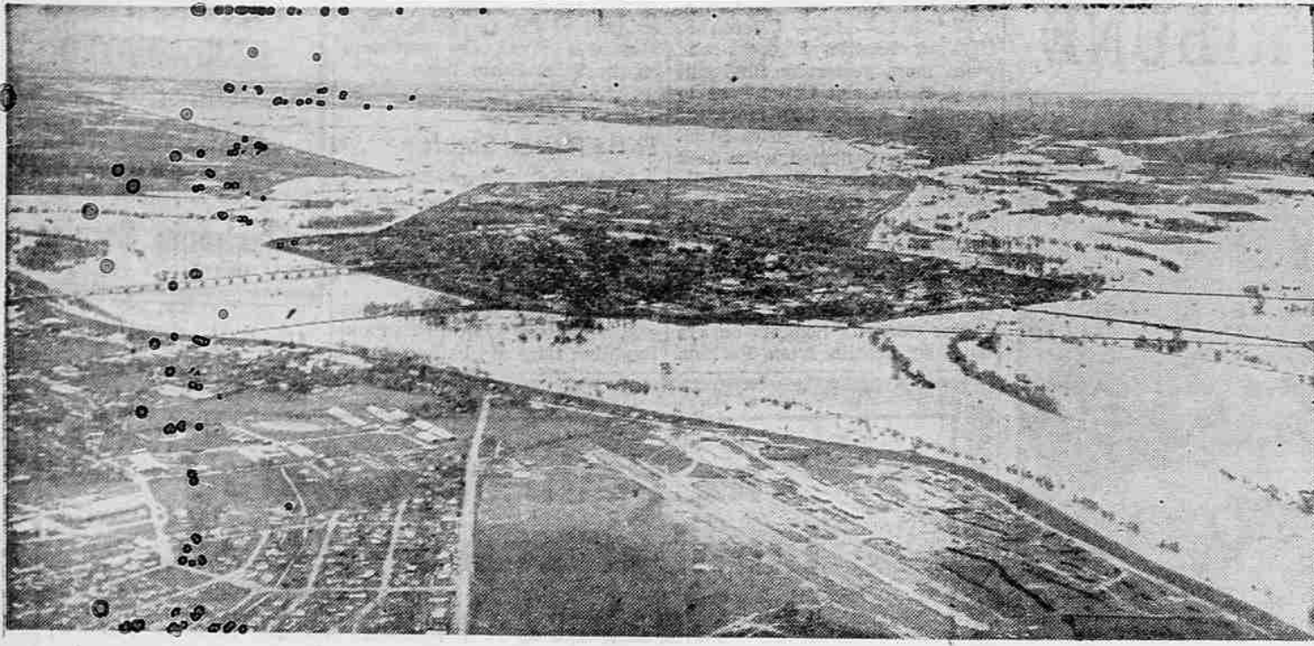
WHY MARYSVILLE HAD TO PACK AND LEAVE—Aerial view of Marysville, Calif., (center) shows city surrounded by flood waters of the Feather River (left) and the Yuba River (right). At lower left is part of Yuba City which flooded when the levee broke after this picture was made. Larger bridge at left is one across which most of the 10,000 Marysville residents were evacuated.