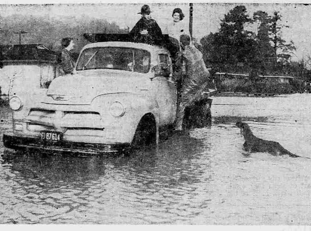
HEY! WAIT FOR ME—Puli, an Irish setter (or is it Hawaiian?) wades up to fire department utility truck to be rescued along with other evacuees at Kentfield, Cal. New storms lashed Northern California with torrential rains and gale force winds, flooding rivers and virtually isolating many sections.

MEDFORD, OREGON, THURSDAY, DECEMBER 29, 1955