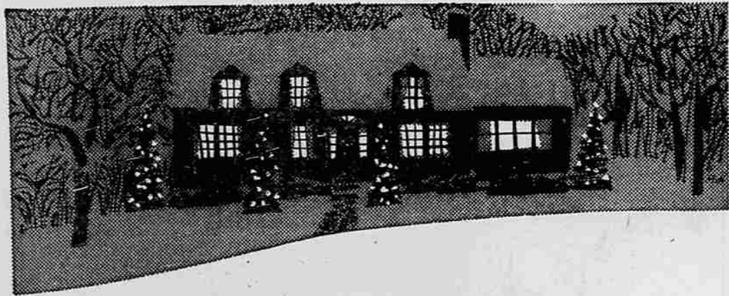
The soft glow of colorful lights radiates . . .