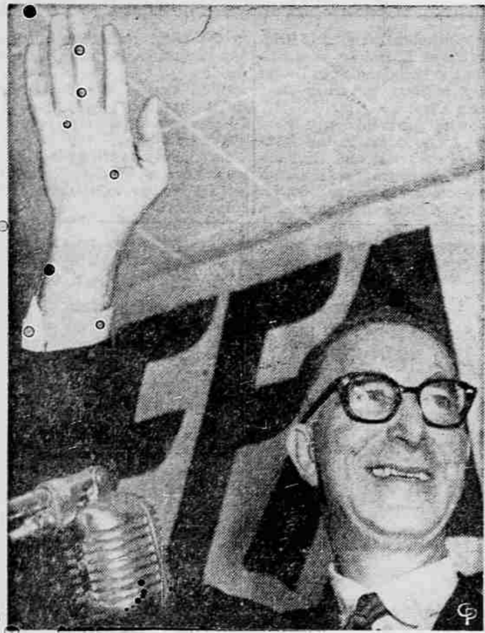
ACKNOWLEDGING CHEERS from Los Angeles supporters, Senator Estes Kefauver, Tenn., announces he "most certainly" will enter California primary in June if he decides to seek Democratic presidential nomination.