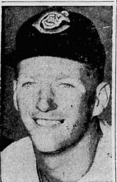
TOP ROOKIE - Cleveland Indian southpaw hurler Herb Score (above) has been named American League Rookie of the Year by the Baseball Writers Assn. in New York.

SAM'S SPORTING GOODS 32 South Central Ave. Medford, Oregon