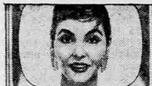
New "4-Plus" Picture Quality. (1) 100% automatic gain control; (2) "Sync" stabilizer that kills interference jitters; (3) 7% extra brightness; (4) 33% extra contrast.