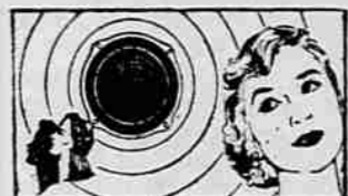
New Balanced Fidelity Sound. Re-creates in your home the entire range of sound sent out by TV networks. The "highs" ... the "lows" that make rich, realistic sound.