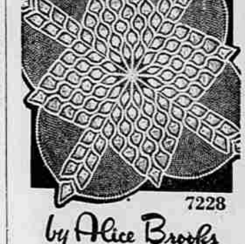
7228 by Alice Brooks

Pretty pineapples in a striking design make this tablecloth the star of your club luncheon! It's 62 inches across with scalloped edges, novel corners. Fast crochet!