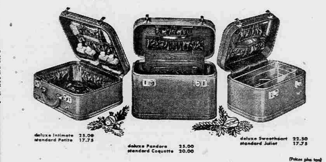
deluxe Intimate standard Petite 23.00 17.75 deluxe Pandora standard Coquette 25.00 20.00 deluxe Sweetheart standard Juliet 22.50 17.75 (Prices plus tax)

ELEGANT NEW SKYWAY COSMETICS CASES can be had from 17.75 to 25.00, and this is something every girl you know (even you, yourself) will love, can use, should have. Skyway cosmetics cases are covered with Koroseal* to keep their elegance forever. Illustrated deluxe styles have wonderful modern travel accessories... even standard cases have special toothbrush holders, wise arrangement of pockets. All have elegant hardware, smart saddle stitchings, splendid taffeta linings.