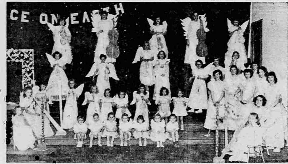
CHILDREN'S ORCHESTRA AND CHOIR To Present Program