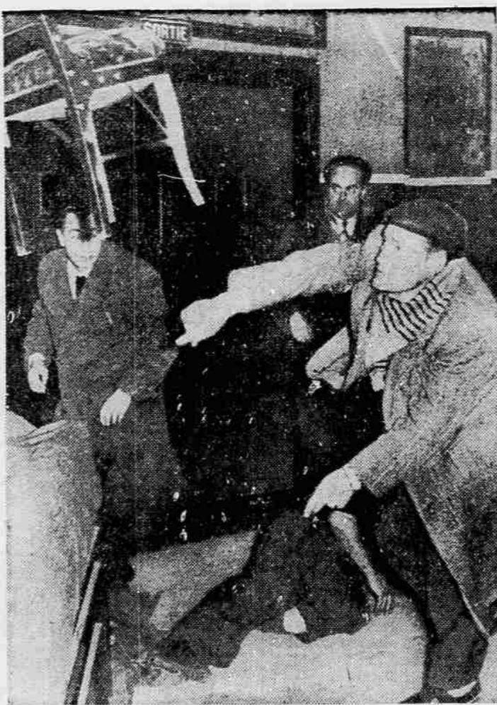
AH, THOSE FRENCH—This Frenchman tries to even the score as he hurls a chair at his opponents who knocked down his companion with a chair during the UDSR (Union Democratique et Socialiste de la Resistance) meeting in Paris. Felled elector slowly rises as onlooker (rear) appears to be keeping score. Brawl started when local Communists moved into the meeting and started heckling the speaker.