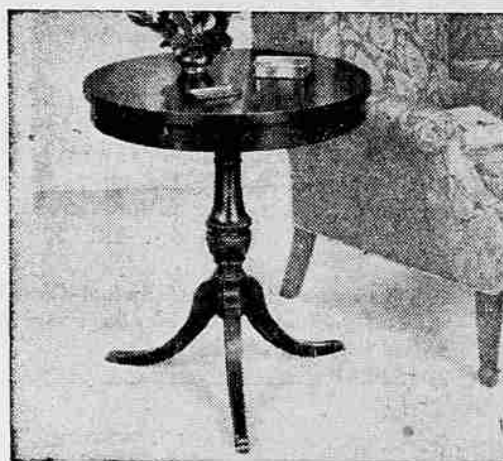
No. 7643 Duncan Phyfe Drum Table with Formica Top Size 23 1/2" x 23 1/2". Height 26".

Mersman Tables $29 95 With Leather Tops NOW ONLY