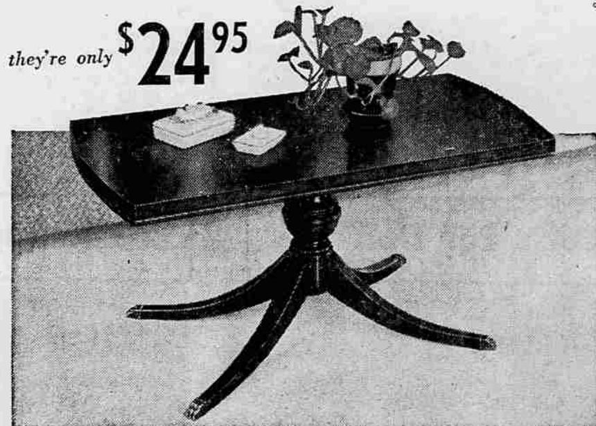
No. 7644 Duncan Phyfe Cocktail Table with Formica Top. Size 17 1/2" x 35 1/2". Height 16".