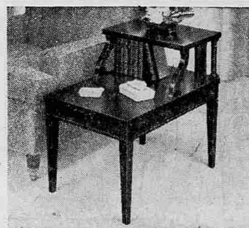
No. 7640 Step Table with Formica Top Size 17 1/2" x 26". Height 16" and 24".

Honestly! These Formica-top tables can really "take it"... and they're so lovely