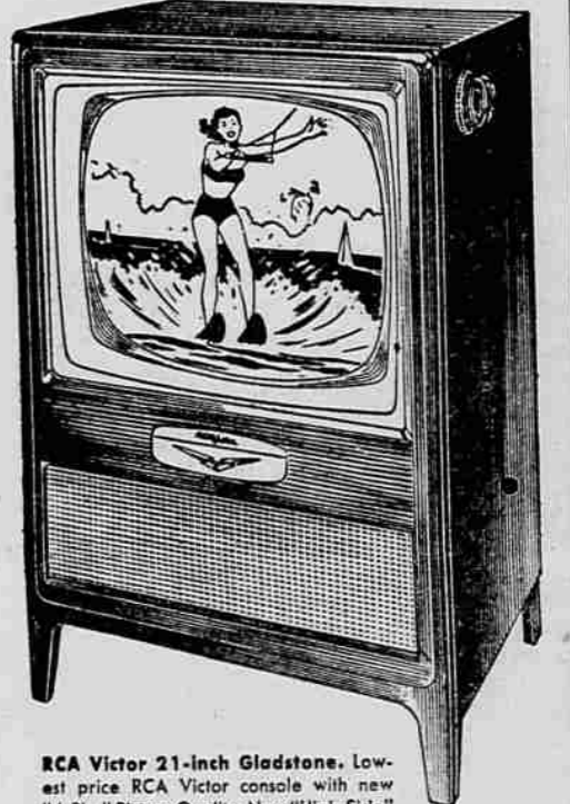
RCA Victor 21-inch Gladstone. Lowest priced RCA Victor console with new "4-Plus" Picture Quality, New "High-Side" Tuning, Mahogany grained finish, Walnut or flamed oak grained finishes, extra. Super model 21T635. $279.95

Stunning new TV— Designed to harmonize with any furniture style!