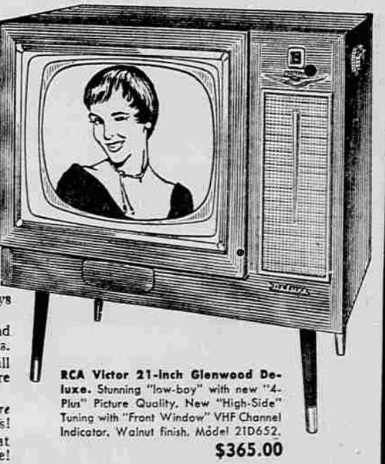
RCA Victor 21-inch Glenwood Deluxe. Stunning "low-boy" with new "4-Plus" Picture Quality, New "High-Side" Tuning with "Front Window" VHF Channel Indicator, Walnut finish. Model 21D652. $365.00

But there's more than beauty to the "Un-Mechanical Look." This is beauty with a purpose—a revolution in design that started from within! Look at—and listen to—these magnificent new RCA Victor TV sets today! You'll know instantly why every year more people buy RCA Victor than any other television!