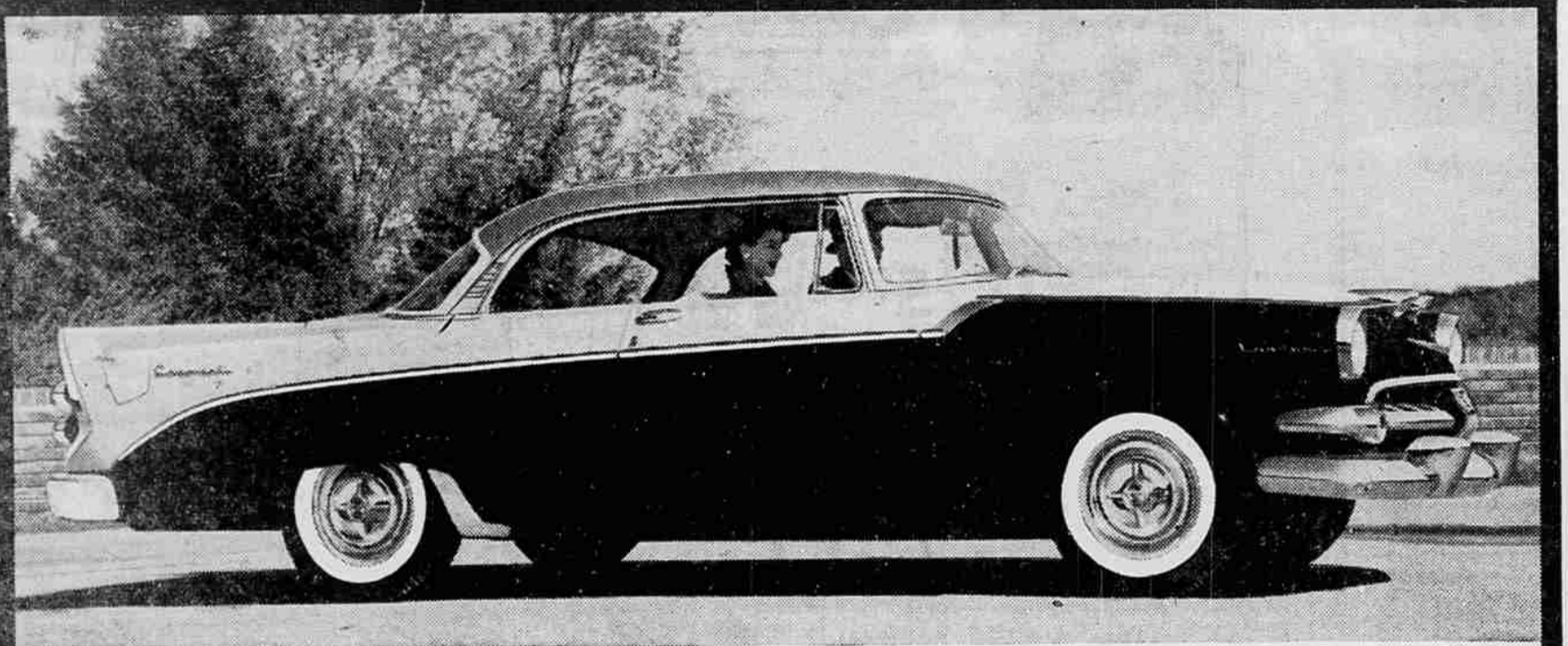
Dodge Coronet... the only full-size, full-styled, full-powered car to invade the low price field.