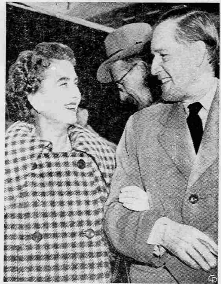
HEADING FOR MEXICAN HONEYMOON, Barbara Hutton, dame store heiress, and sixth husband, Baron Gottfried von Cramm, arrive in New York from Europe.

The busiest highway in the world is the New Jersey Turnpike.