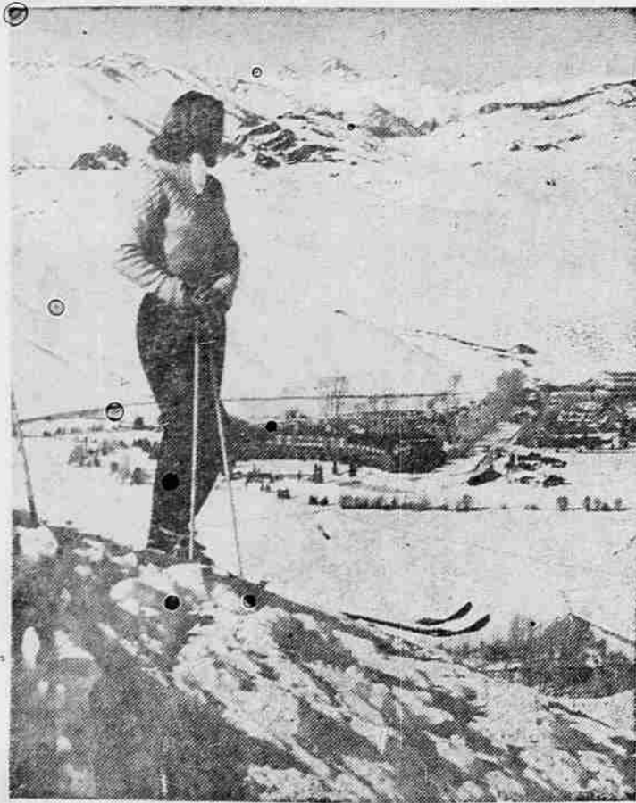
RUGGED BEAUTY —This skier pauses in her flight down the mountainside to take the sight at Sun Valley, Idaho. The mile-high Union Pacific village she is looking down on is nestled in the heart of the sweeping Sawtooth Mountains.