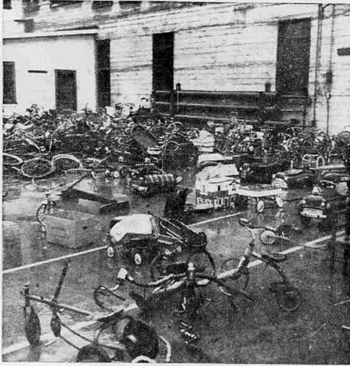
From this heap of discarded toys come scores of good-as-new wagons, bicycles, tricycles and doll buggies which will delight the hearts of Jackson county small fry on Christmas day. Medford firemen have been carrying on the project for 25 years; have been aided by Medford Lady Lions in recent years.