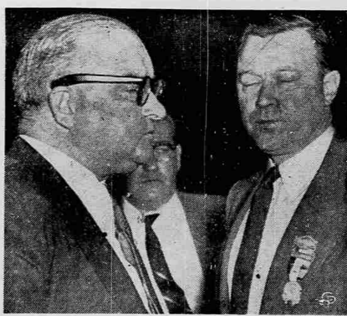
COLD GREETING as Michael J. Quill (left), president of Transport Workers Union, walks past Walter Reuther, CIO president, at giant union meeting in New York. Quill opposes joining of CIO and AFL but delegates ratify merger bringing 15 million members into one labor group.