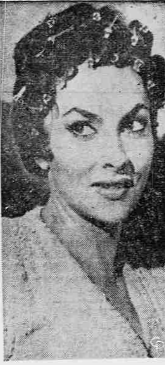
EVER wonder how Hollywood beauties look so natural? Here is Gina Lollobrigida, Italian star, on lot in Paris during rest period.