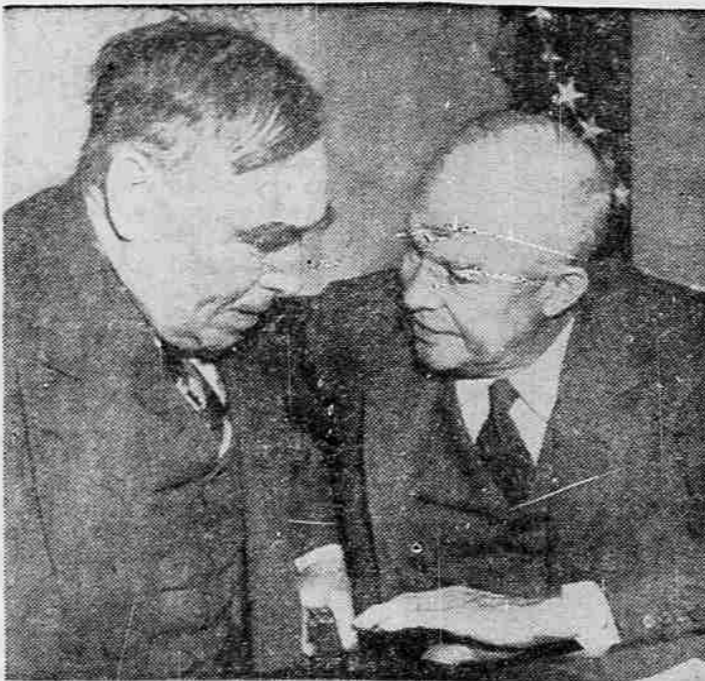
PREDICTS IKE WILL RUN — House Republican leader Joseph W. Martin Jr., shown with President Eisenhower in his Gettysburg office, predicted after the conference that the President "for the sake of the world will consent to run for re-election." He emphasized that the President did not reveal his intentions. His prediction was only his own personal opinion and impressions.

An attorney for Moist Cold said the decision probably would be appealed.