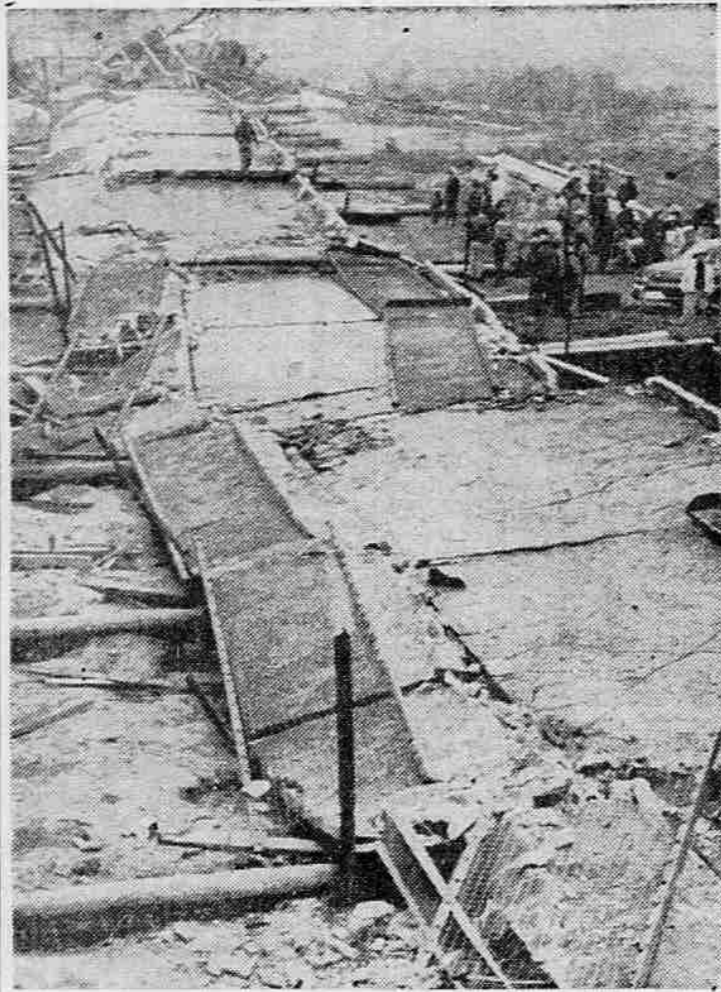
DOWN BEFORE IT'S BUILT —A 150-foot temporary section of the new International Bridge near Eagle Pass, Tex., lays in the dry Rio Grande River bed after collapsing while under construction. At least 35 workmen were injured, two of them critically.

The CAL process consists of foaming a low-density, high-strength plastic core inside a mold, then applying a skin of glass fabric impregnated with resin in a "sandwich" pressing treatment.