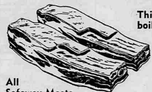
Plate Cut BOILING BEEF

Thick, tender plate cuts of tender boiling beef. Every cut is fully guaranteed to please.