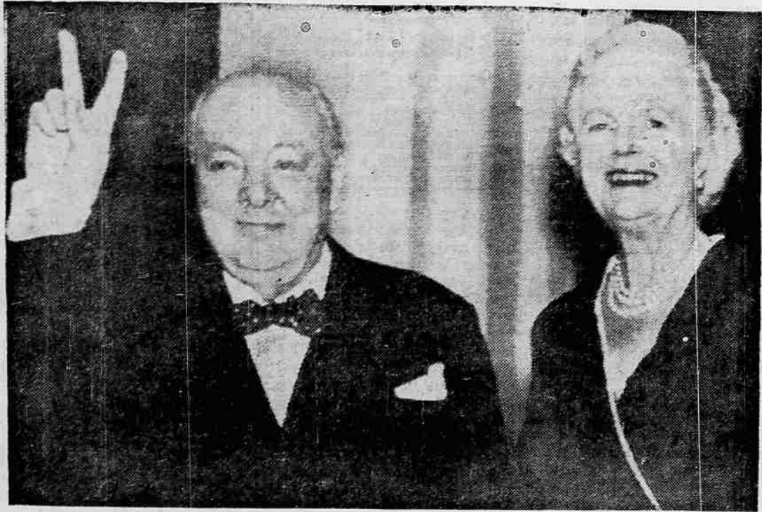
GOING STRONG —Sir Winston Churchill gives famous V-for-victory sign as he celebrates his 81st birthday with Lady Churchill at their London residence. The former British Prime Minister marked the occasion quietly with a family luncheon.