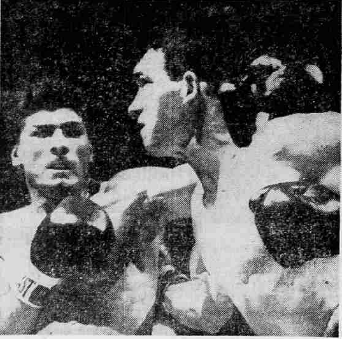
A REAL SOCKFEST —Argentine middleweight Eduardo Lause (left) swaps blows and grimaces with Gene Fullmer of West Jordan, Utah, during their 10-round sockfest in New York that kept a crowd of 4000 cheering. The bout was televised nationally. Lause, who now wants a crack at Bobo Olson's title, won by a unanimous decision but Fullmer was in there slugging with him until the last bell. It was Lause's 30th straight win.