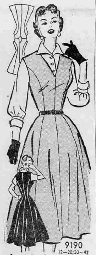
9190 12-20;30-42 by Marian Martin

So essential for winter — the jumper and companion blouse! Simple, princess lines do such wonderful things for your figure — make sewing a cinch! Wear this smart twosome for daytime — jumper alone for gala evenings!