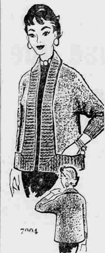
7004 by Alice Brooks

Stunning jacket you'll wear from now through spring! Pattern stitch forms wonderful tweed-like texture; ribbed band for trim!