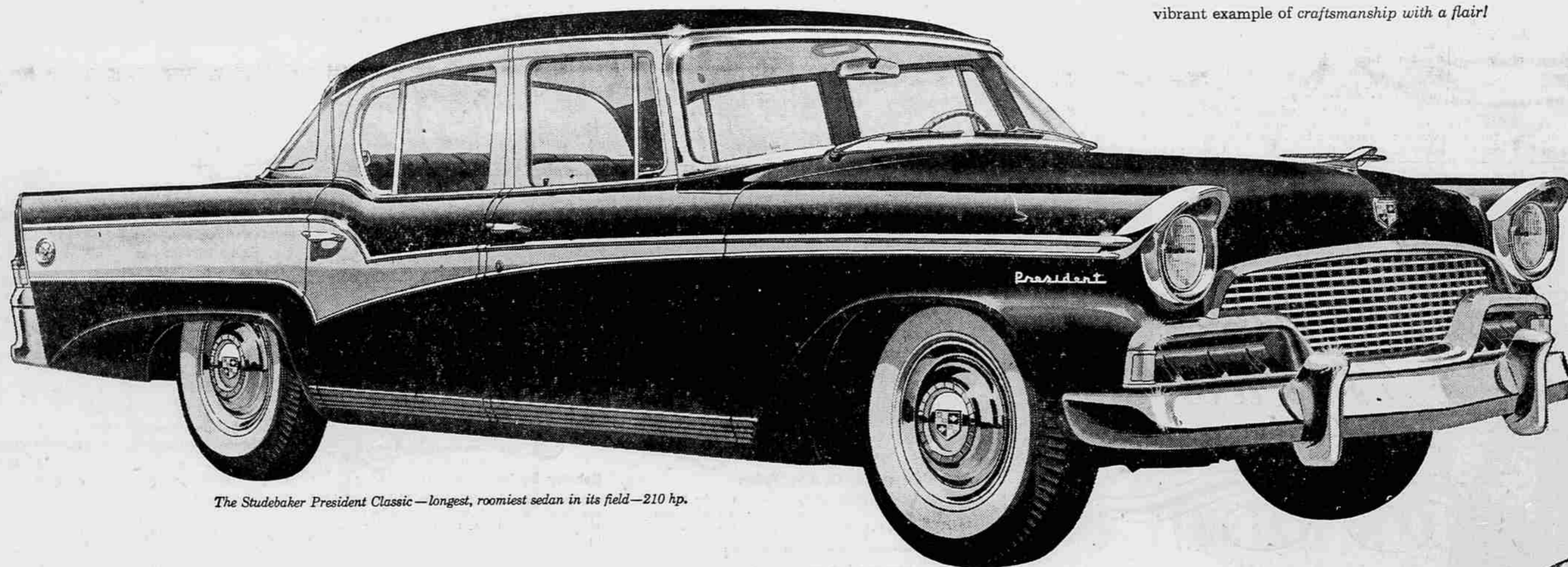
The Studebaker President Classic—longest, roomiest sedan in its field—210 hp.

Make way today for the one new car that stands out from all the rest—the big new Studebaker! Here's a really new look in the low price field. Longer, stronger lines, greater roominess, standout styling!