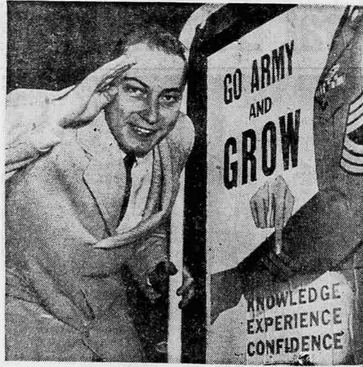
BASEBALLS OR GRENADES? —Brooklyn's World Series hurling hero Johnny Podres gives out with a snappy salute as he arrives at Albany, N. Y., recruiting station for his physical. Podres, 23, was rejected three years ago because of a back ailment. The Dodgers' front office is reported to have suspended all trade negotiations until it is learned whether Johnny will be pitching for Uncle Sam or Brooklyn next year.