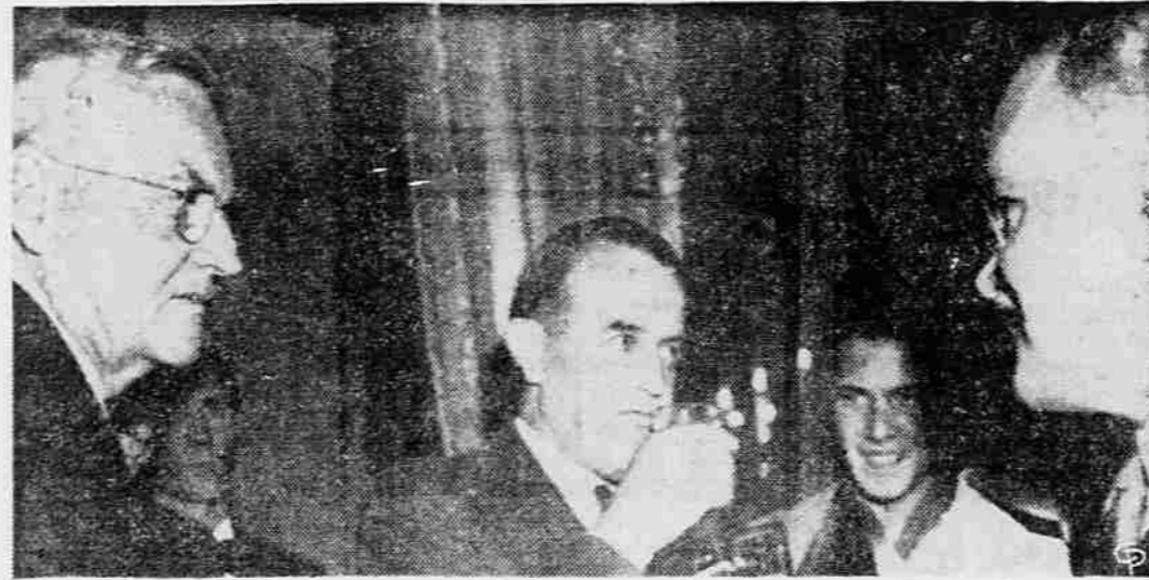
RELAXING AT LUNCHEON given by Max Petitpierre, Switzerland's president, at his Geneva villa, John Foster Dulles (left), U. S. secretary of state, and V. M. Molotov, Soviet foreign minister, shake hands as they sip champagne before dining.

The lanky author has written some of the greatest stage successes of modern times. He received Pulitzer prizes for writing "Idiot's Delight" in 1936, "Abe Lincoln in Illinois" in 1938, and "There Shall Be No Night" in 1941.