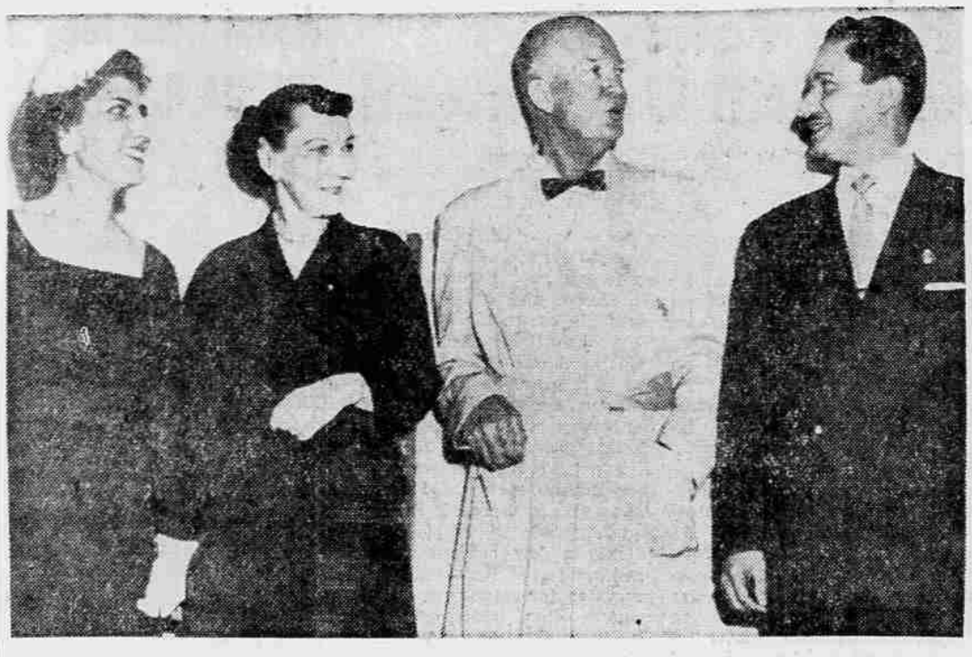
UNUSUAL STATE VISIT —Guatemala President and Mrs. Carlos Castillo Armas pose with President and Mrs. Dwight Eisenhower after paying like a 20-minute visit in his suite at Fitzsimons Hospital in Denver. The visitors from Central America gave Ike and Mamie several gifts, including a marimba, native doll, Indian drum and a United States presidential flag, handmade by a group of Guatemalan nuns.