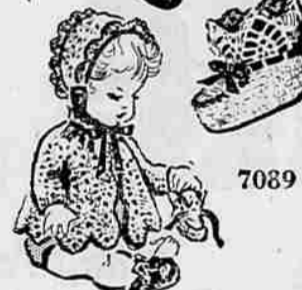
by Alice Brooks

Perfect gift for the new baby — booties, cap and jacket made in a pretty pineapple pattern! EASY crochet — in sparkling white or dainty pastel color!