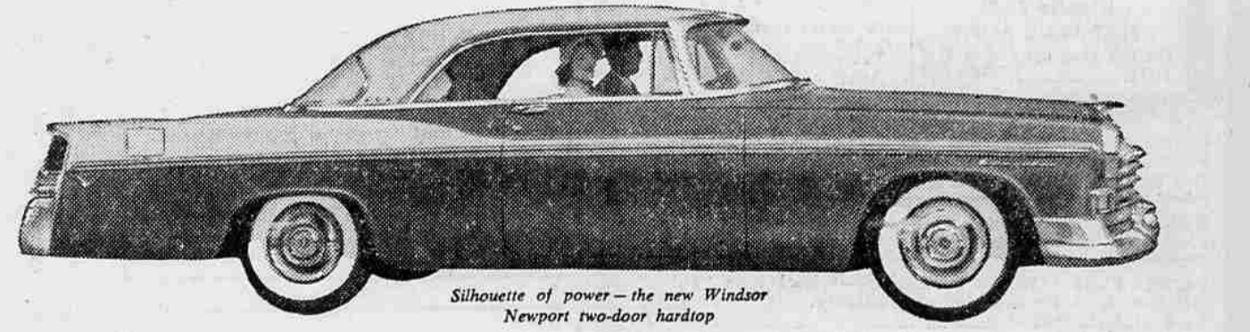
Silhouette of power—the new Windsor Newport two-door hardtop

● New Construction ● Remodeling ● Free Estimates PHONE 2-4931 or 3-1064