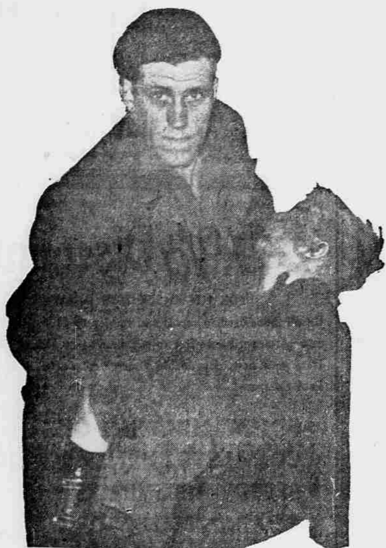
IT MIGHT BE YOU AND A LOVED ONE