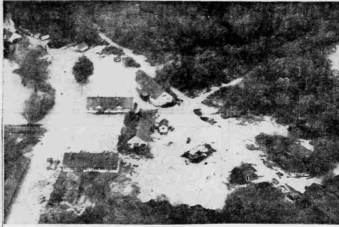
NORTHWEST HIT BY FLOODS —Coast Guard helicopters and boat crews are stepping up rescue operations evacuating persons marooned by flooding Pysht River (above) near Pysht, Wash. Farms and homes surrounded by water in the lowlands face further flooding as more storms are expected.