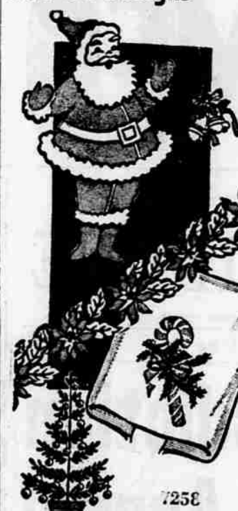
7258 by Alice Brooks

Save! Just the stroke of an iron— presto! Tablecloths, place mats, towels sparkle with vivid colors of bright red and leaf green. Easy! No embroidery! Washable! Make lovely gifts!