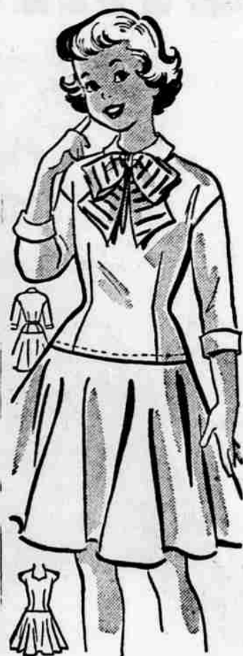
9305 6-14 by Marian Martin

Thrill your little girl with the very newest fashion—the Paris inspired longer-waist, above her favorite whirly skirt! Make two versions—one with a saucy bow—the other with dainty sweetheart neckline. She'll love her new "Paris" look—and so will you!