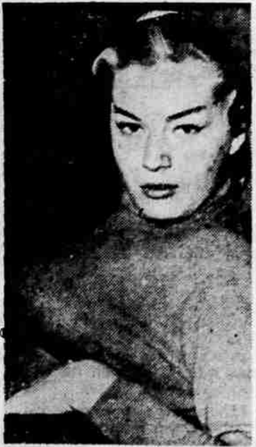
ITALIAN MEN GREAT PINCHERS —Swedish actress Anita Ekberg (above) claimed that Italian men are crazier about touching, pinching and patting women than any other males in the world. Especially with the "Mano Morta" or "dead hand."