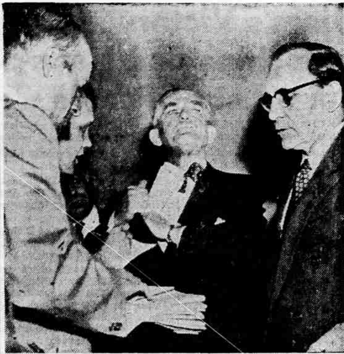
SENATORS SILENT —Democratic Senators John L. McClellan, Ark. (right), and John Stennis, Miss. (center), returned to Washington aboard regularly scheduled Military Transport Service plane and said tartly the Defense Department will have to explain statements that a special plush plane had been sent at their request to Europe to pick them up.