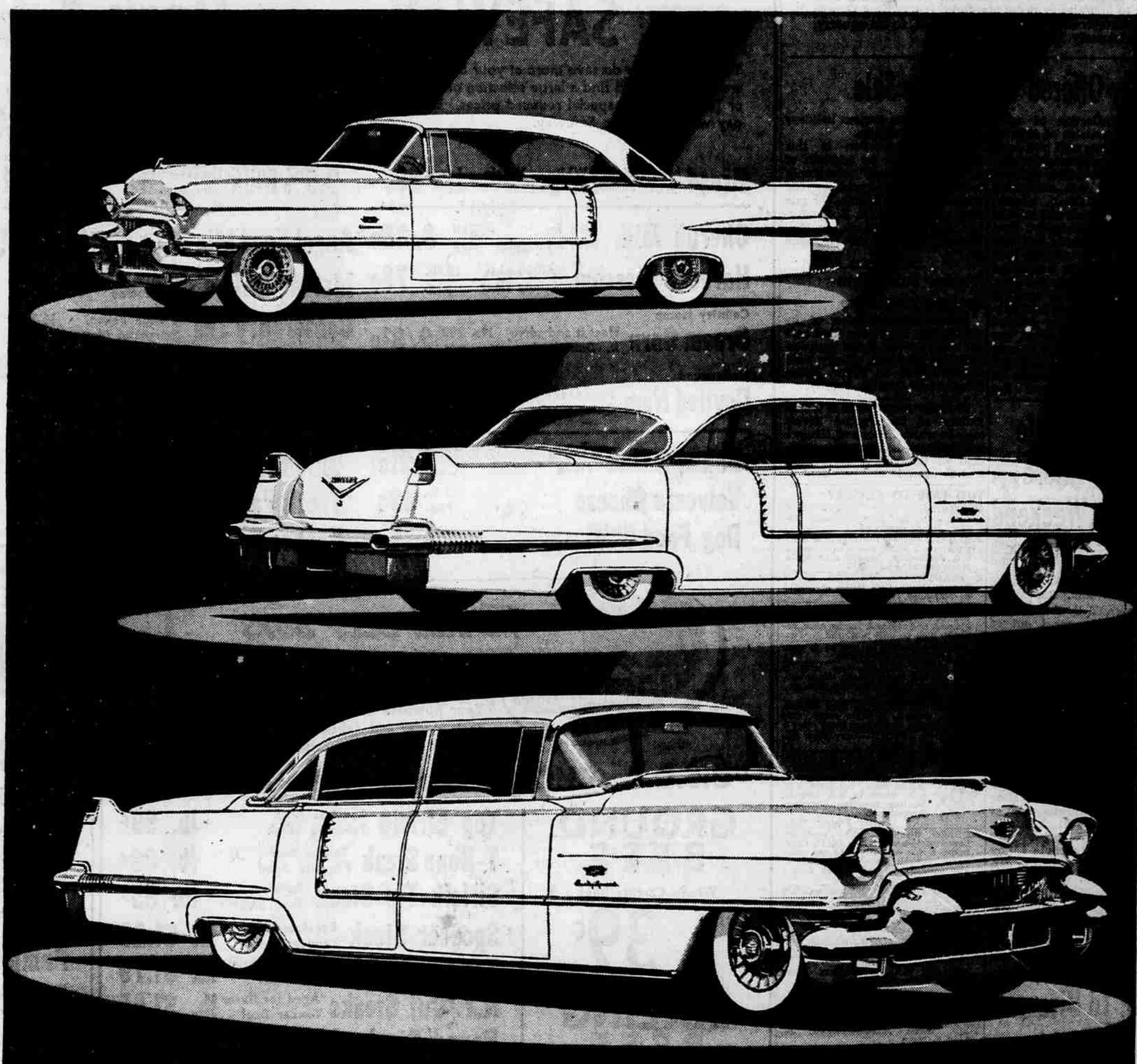
Top to bottom—Eldorado Seville, Sedan de Ville, Sixty Special

Presenting the Most Inspiring Motor Cars the World Has Ever Seen!