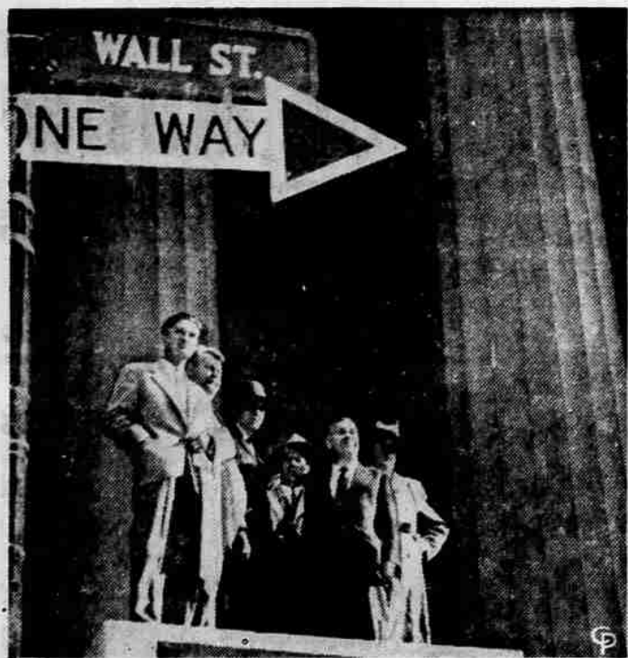
ARRIVING IN NEW YORK for month-long study of American life, Soviet journalists visit Wall Street, heart of capitalistic system they oppose. Group is standing outside Federal Building, Broad and Wall streets.