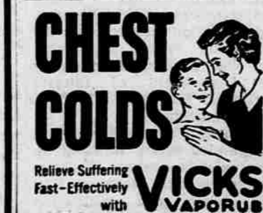
Relieve Suffering Fast-Effectively with VICKS VAPORUB