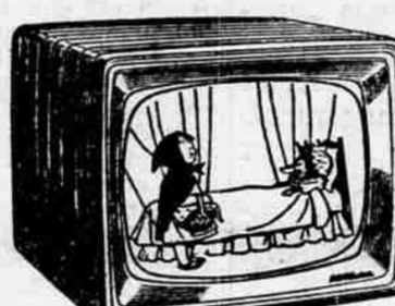
RCA Victor 17-inch Thrifton. Budget priced RCA Victor TV 37% smaller cabinet than previous table models. Lined oak grained finish. Rollaround stand, extra. Model 1756027. $169.95