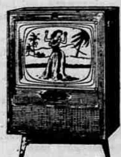
RCA Victor 21-inch Brittonhouse. Swivels! Three finishes: natural walnut and blond tropical hardwood; blond tropical hardwood and natural walnut; two-tone birch. Model 210648. $525.00