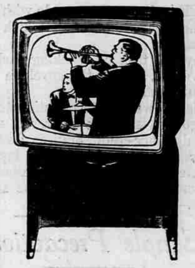
RCA Victor 21-inch Pickwick. It swivels! It has 2 speakers! New "4-Plus" Picture Quality. New "Hidden Panel" Tuning. Mahogany grained finish. Model 2176255. $269.95