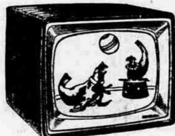
RCA Victor 17-inch Thrifton. Lowest priced RCA Victor TV Cabinet 37% smaller than previous table models. Ebony finish. Rollaround stand, extra. Model 1756022. $159.95

NEW RCA VICTOR SPECIAL SERIES from $000 00