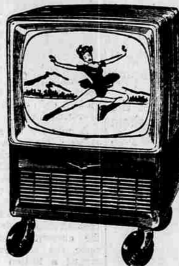
RCA Victor 21-inch Trampoline. "Big-Whorl" rollaround TV! Two speaker! New "4-Plus" Picture Quality. Mahogany grained finish. Model 2176225. $269.95