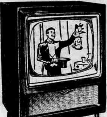
RCA Victor 21-inch Brady. Lowest priced RCA Victor 21-inch console Famous Oversize "All-Clear" picture. Mahogany grained finish. Lined oak grained finish, extra. Model 215632. $259.95