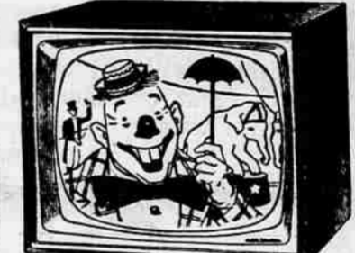
RCA Victor 21-inch Towne. Lowest priced RCA Victor 21-inch TV Aluminized Oversize "All-Clear" picture tube. Black textured finish. Stand, extra. Model 2156032. $189.95