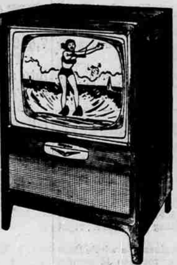
RCA Victor 21-inch Gladstone. Lowest priced RCA Victor console with new "4-Plus" Picture Quality. Mahogany grained finish. Walnut or lined oak grained finishes, extra. Model 217635. $279.95