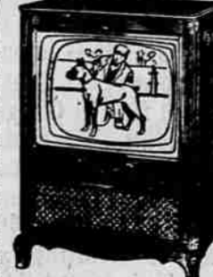
RCA Victor 21-inch Chalfont. Beautiful Provincial console in rich wood finish. New "4-Plus" Picture Quality. Two speakers. Model 210647. $365.00

Or Add To Your Present Account — NO MONEY DOWN