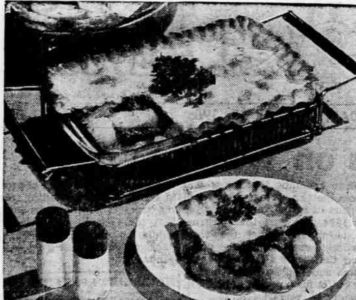
VEGETABLE-BEEF PIE —Your foods editor may be in Chicago feasting on pretty fancy foods, but actually there are few things better on anybody's table than this fresh vegetable and beef stew pie made with plentiful, economical beef and vegetables.

Hawaii called again when the Pineapple Growers Association introduced something new in table fashions. Fifteen table settings, all featuring pineapple yellow were designed and presented by Helen Chamberlin, leading table fashion authority. A pineapple table d'hote showed eight tables carrying out in color and motif the pineapple theme. There was a Sunday brunch of exquisite beauty, a pre-game football buffet table, a party table planned for Dennis the Menace, a quite sophisticated Halloween table had a fabulous black cat collared with orange and yellow orchids. A setting for a Christmas open house was centered