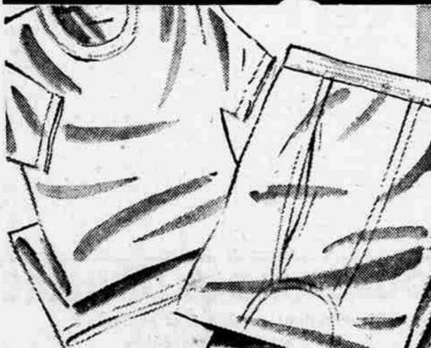
WARM... LIGHT... STRONG 75% COTTON, 25% DYNEL

Sanforized vat dyed flannel sleepwear that little girls love. Lots of cute prints and trims in sizes 4-16.