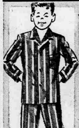
BOYS' SANFORIZED FLANNEL PAJAMAS 2.49

Boys' cotton flannelette pajamas... at wonderful Penney savings! Button front or slip-over model. Snug elastic top pants. Sanforized. Machine washable.