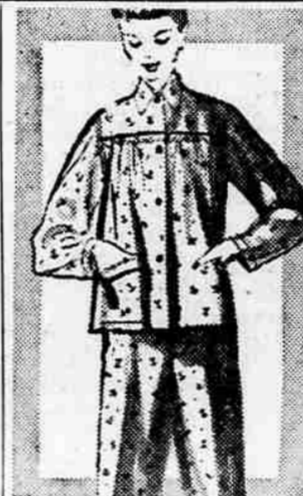
WOMEN'S PRINTED FLANNEL PAJAMAS 2.98

Wonderful wear - everywhere jacket... at wonderful Penney savings! Wind-resistant, water-repellent plastic, warmly quilted. Snug-knit collar, cuffs, waistband keeps cold out. Top colors.