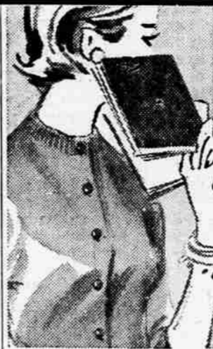
WOOL SANFORLAN CARRIGAN SWEATERS 5.90

The better half of your separate wardrobe—Penney's fine gauge wool sweaters you can wash safely, forget about blocking. You'll find them in a huge range of autumn colors. Sizes 36 to 42.