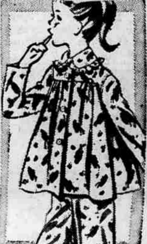
GIRLS' SANFORIZED FLANNEL PAJAMAS 2.98

Penney special! Quilted nylon fashion duster at a price that's a gift for your budget! Beautiful floral printed robe is quilted inside and out for extra softness, machine washability in lukewarm water. Aqua or rose on white. Sizes 10 to 18.