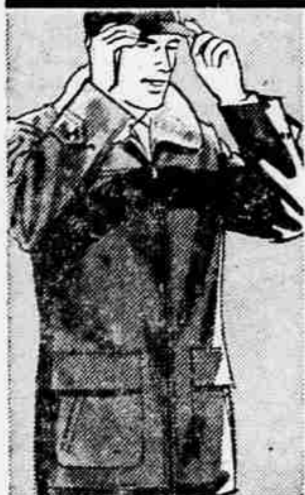
ROOMY SURCOAT QUILT LINED 12.75 38-46

Men! Save and be warm with Penney's surcoats! Sheen gabardine blend of rayon-acetate-nylon. Water, wrinkle resistant. Quilt lined. Thick dynel collar. Trimly styled.