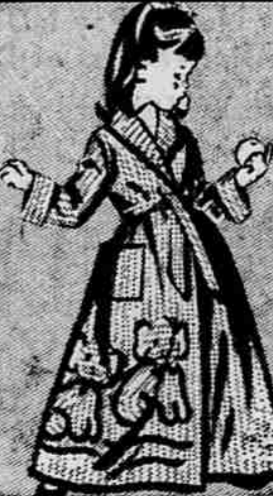
GIRLS' WARM CHENILLE ROBES 3.98 8-16

A terrific price on an all nylon quilted lined snow suit for toddler boys or girls. Zip front and water repellent treated. Sizes 2, 3, 4. Brown or green.