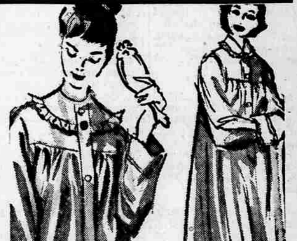
SAVE! PENNEY'S COTTON FLANNELETTE GOWNS 1.98

A Penney Find! The warm, cozy mother Hubbard gown takes on a festive air. Rows of nylon net ruffling at yoke... rayon satin ties at neckline and waist! In good pastel colors.