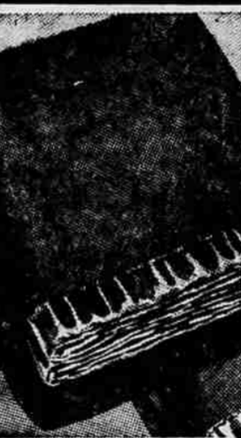
BIG 3 1/4 LB. 90" ALL WOOL BLANKET 9.90

Fine Quality Plaid Pairs, soft, closely-woven in clear colors 3 1/2 pounds. Cotton, rayon, wool, 72 by 84-inches folded.