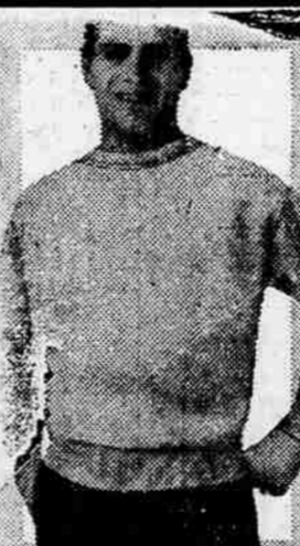
WARM COTTON SWEAT SHIRTS IN COLORS 1.69

Less bulk, less weight, more warmth in Penney's cotton union suits! A perfect blend... absorbent, resilient, rugged... completely moth-free and itch-free. Machine washable.