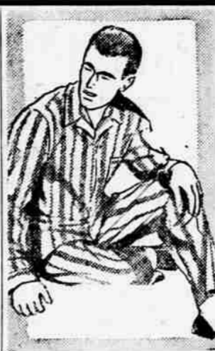
MEN'S SANFORIZED FLANNEL PAJAMAS 3.49

Men! Save and be warm with Penney's surcoats! Sheen gabardine blend of rayon-acetate-nylon. Water, wrinkle resistant. Quilt lined. Thick dynel collar. Trimly styled.