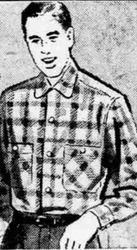
SANFORIZED FLANNEL SPORT SHIRTS 1.98

The detailing, fashion coloring and all-over Penney quality of these sport shirts are superb! And you can dunk them in the family wash without worry! An ideal Fall wardrobe builder.