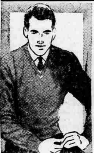
MEN'S ORLON PULLOVER SWEATERS 5.90

Fine quality high bulk orlon pullover sweaters in a host of popular new shades. Washable orlon that doesn't need blocking. Sizes S, M, L.