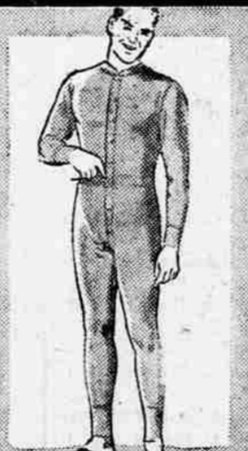
MEN'S HEAVY COTTON UNION SUITS 2.29

Undershirts, Sizes 34 to 46 Drawers, Sizes 30 to 42 1.79 EACH