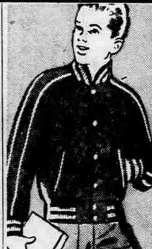
BOYS' REVERSIBLE WOOL JACKETS 6.90

Boys' cotton flannelette pajamas... at wonderful Penney savings! Button front or slip-over model. Snug elastic top pants. Sanforized. Machine washable.