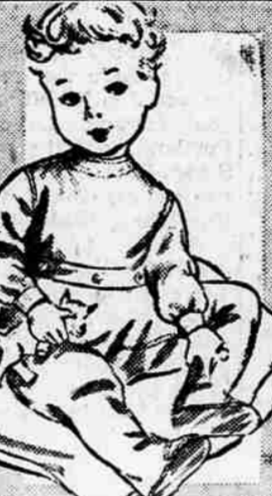
PLASTIC SOLED INFANTS' SLEEPERS 2.19

Sleepy Time Gals Love Penney's Printed PJs! They're cozy cotton flannelettes designed to keep the young 'uns snug in their beds. And they're gay prints designed to appeal to their eyes! Sizes 34-40 in 2 pretty gift-perfect styles!