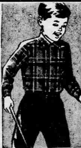
BOYS' PLAID FLANNEL SHIRTS Sizes 10-18 1.49

Penney's smart two-tone Melton jackets reverse to sparkling water-repellent acetate satin! Braid trim. Snap front. Raglan sleeves. 100% reprograss wool Melton.