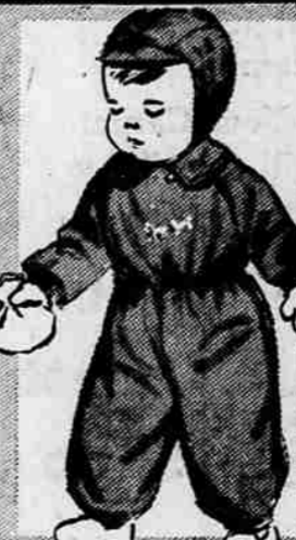
TODDLERS' FLEECE LINED SNOWSUITS 5.00

An eye-catching slipper any gal will love—fur-trimmed slippers from Penney's! They're of smooth sheepskin, prettily hand-beaded, and made with the softest soles ever. Blue, red or white with white fur collar. Mint-Pink. Sizes 4 to 9.