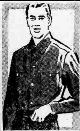
MACHINE WASHABLE CORDUROY SHIRTS 3.98

Fine quality high bulk orlon pullover sweaters in a host of popular new shades. Washable orlon that doesn't need blocking. Sizes S, M, L.