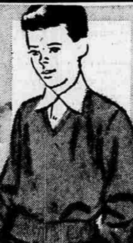
BOYS' 100% ORLON SWEATERS 4.98

At Penney's thrift price... boys' flannel shirts of Sanforized cotton suede. Attractive plaid patterns. Long sleeve model. Smart round collar. Machine washable.