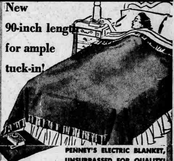
New 90-inch length for ample tuck-in! PENNEY'S ELECTRIC BLANKET, UNSURPASSED FOR QUALITY!

Compare! All wool blankets full 90 inches long, guaranteed 5 years against moth damage. 8 colors. 3 1/4 pounds. 72 inches wide.