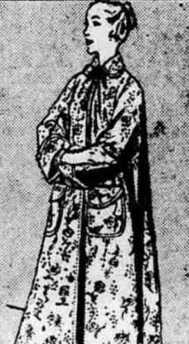
WOMEN'S QUILTED NYLON DUSTERS 8.90

3-PIECE-KNIT Imagine! Plastic-soled sleepers at a price so low! Snap them up at Penney's—warm, soft-napped cotton knits, with grip-napped cotton knits, with grip-napped fasteners for easy dressing, elastic back waist for snug fit. Pastels; sizes 1 to 4.