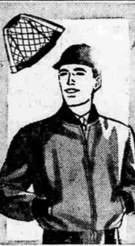
PLASTIC QUILT LINED JACKETS 8.90

Soft brushed tones enrich Penney's warm cotton suede sport shirts! Tailored with blunt collar, straight bottom, adjustable cuffs. Sanforized. Machine wash in lukewarm water.