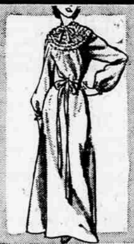
LADIES' BRUSHED BEMBERG GOWNS 3.98

The better half of your separate wardrobe—Penney's fine gauge wool sweaters you can wash safely, forget about blocking. You'll find them in a huge range of autumn colors. Sizes 36 to 42.