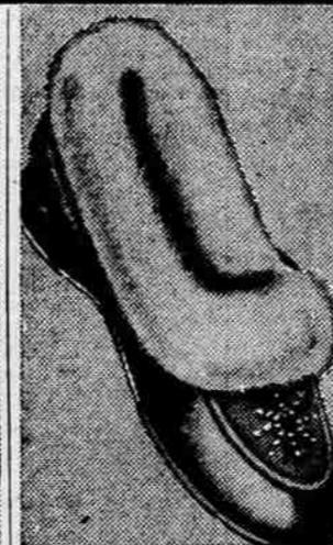
LADIES' WARM FUR TRIMMED SLIPPERS 2.98

Soft. Lush! Orlon pullovers for boys! 100% bulk Orlon in trim-fitting fine gauge knit, hand-looped V-neck. Ribbed cuffs, tail. Washable! Shrink-resistant! Superb colors.