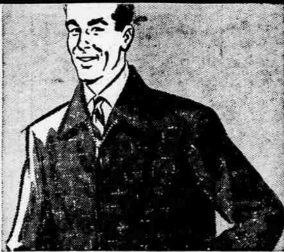
SHEEN GABARDINES IN SUBDUED SPLASH PRINTS 8.90

Penney's Towncraft® Sanforized cotton flannelette pajamas for men. The warmth you want, plus unusual comfort. Every pair cut over Penney's own proportioned patterns. Button or slipover. Stripes or novelty prints.