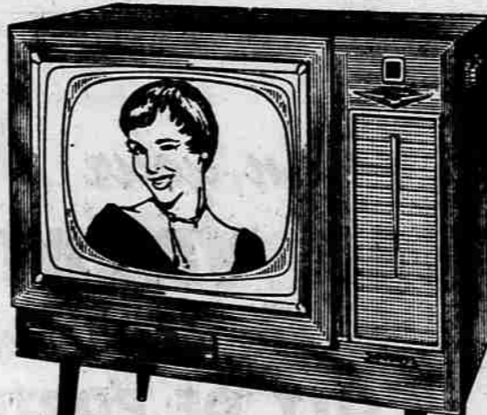
RCA Victor 21-inch Slimwood Deluxe. Stunning "low-boy" with new "4-Plus" Picture Quality! New "High-Side" Tuning with "Front Window" VHF Channel Indicator. Walnut finish. Model 21D652. $365.

IT'S THE BIG CHANGE IN TV BY RCA VICTOR that brings you the "Un-Mechanical Look"... a fresh new viewpoint in TV styling that makes all other TV seem old-fashioned! Gone are obvious knobs and gadgets. There's nothing in view but TV's finest picture and most luxurious cabinetry!