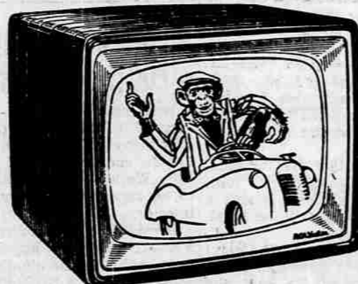
RCA Victor 17-inch Thrifton. Budget-priced! Cabinet 37% smaller than previous table models. New "Hidden Panel" tuning, ebony finish. Rollaround stand, extra-special model 1756025. $159.95