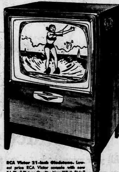
RCA Victor 21-inch Slimline. Lowest priced RCA Victor console with new "4-Plus" Picture Quality! New "High-Side" Tuning. Mahogany grained finish. Walnut or Rose oak grained finish. Extra. Super model 217633. $279.95