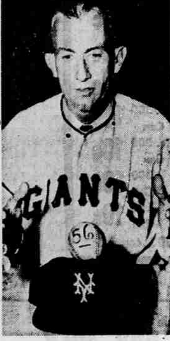
WILL HE NEED MAGIC?—Bill Rigney makes his debut as manager of the New York Giants by going slightly mystic in their New York office by attempting to discern, via the "crystal ball" what his team's chances are in 1956.