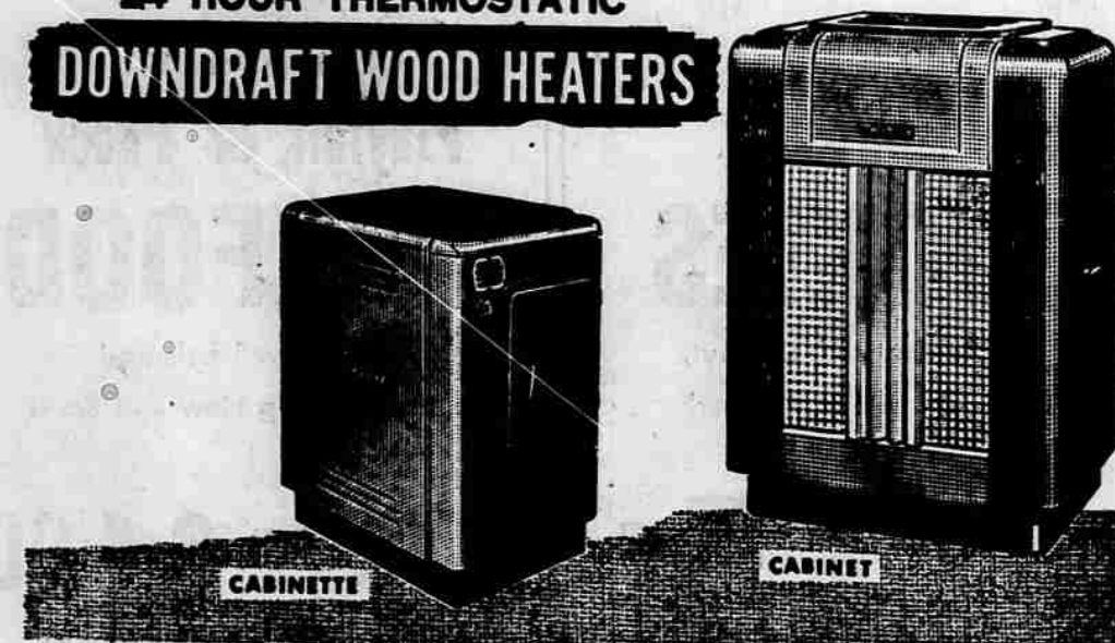
NOW ON DISPLAY